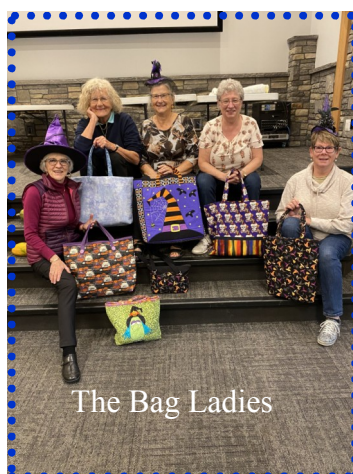
The Bag Ladies